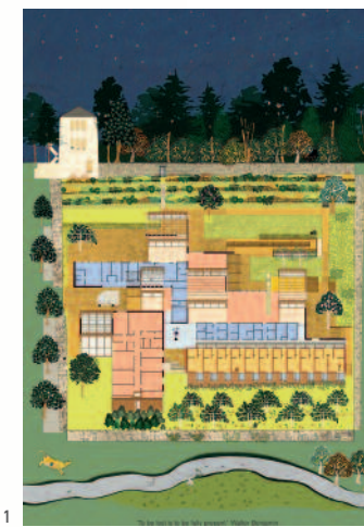
4 Drawing of the Orchard Day and Respite Centre Photo Niall McLaughlin Architects